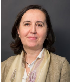
Inmaculada Placencia Porrero , DG EMPL, European Commission

Inmaculada Placencia Porrero is a Senior Expert on Social Affairs, Disability and Inclusion at Directorate-General Employment, Social Affairs, and Inclusion at the European Commission. Her unit is responsible for the coordination of European policies for persons with disabilities. She was responsible for the Task Force for the preparation of the European Accessibility Act and remains responsible for its transposition. Currently, she is leading the team working on the implementation of the Strategy for the Rights of Persons with Disabilities 2021-2030, and of the United Nations Convention on the