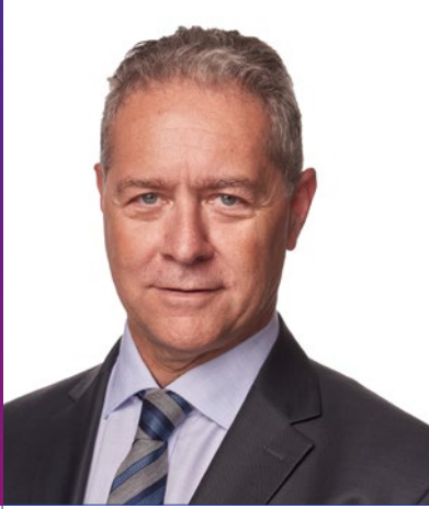
Tonko Obuljen BEREC Chair 2024

The Body of European Regulators for Electronic Communications (BEREC) aims to foster and promote the independent, consistent, and high-quality regulation of digital markets for the benefit of Europe and its citizens. BEREC was established by Regulation (EU) 2018/1971 of the European Parliament and of the Council of 11 December 2018, amending Regulation (EU) 2015/2120 and repealing Regulation (EC) No 12 11 (the ‘BEREC Regulation’).